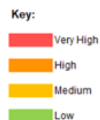
Count of Risks by Status