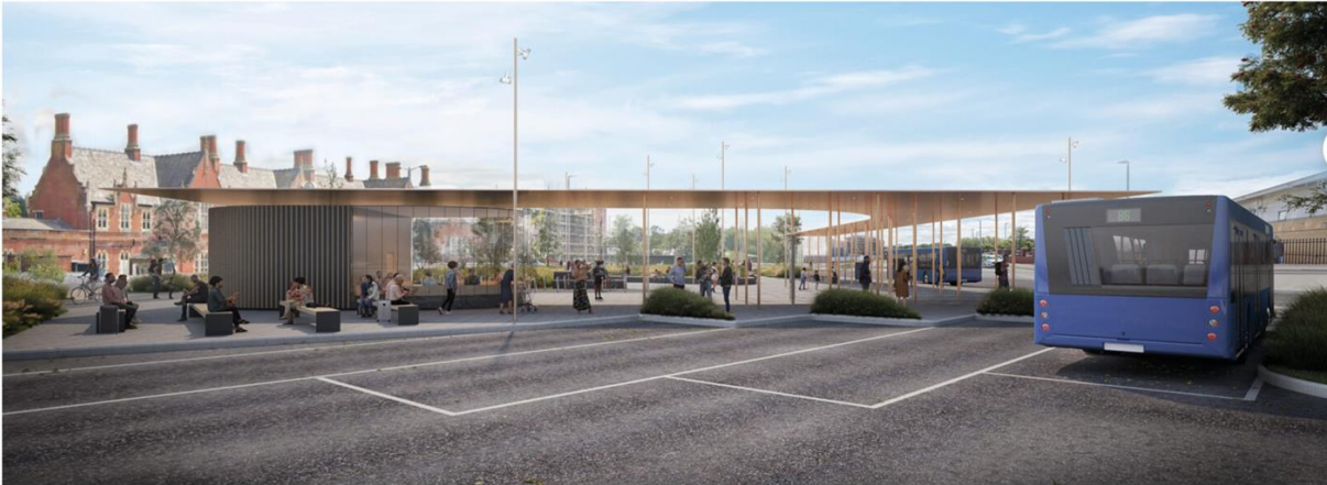
View from “ Drive in Reverse Out ” (DIRO) Bus Stop