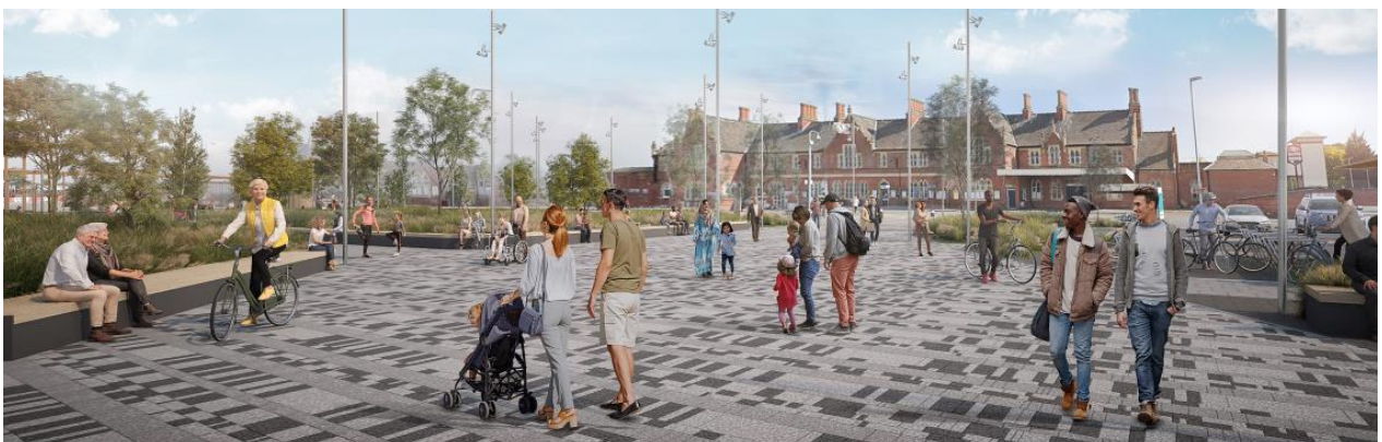
View from City Link Road