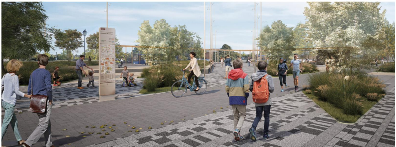
View from Station Exit