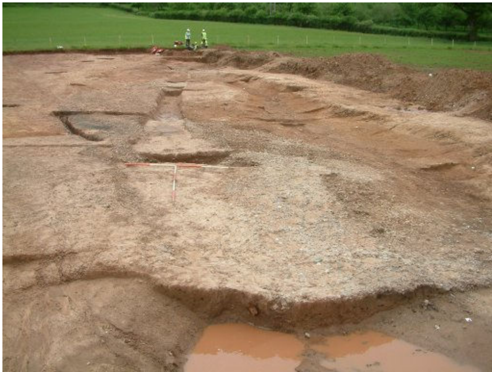
General view of the Ribbon looking south