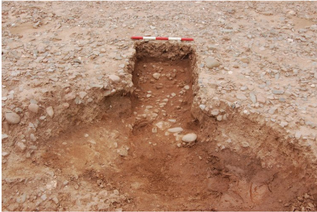
Partial section through the Ribbon surface